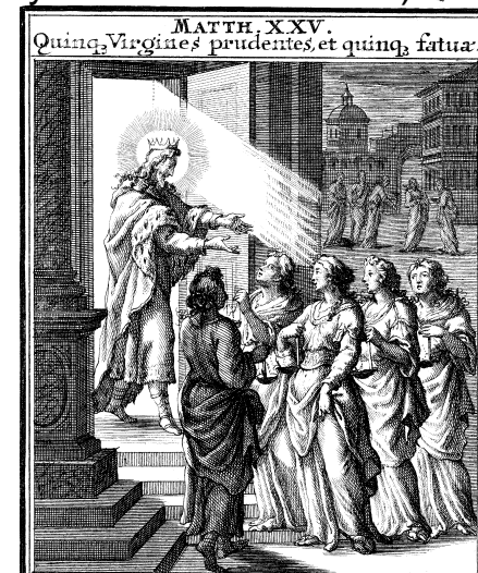
Woodcut illustration from a 1695 Bible – Matthew 25:1-13 Jesus receives five bridesmaids ( saved ), but five unwise are left ( unsaved ).

Our Savior Lutheran Church ✠ Lakeland, FL USA (Last Sunday of the Church Year) 🕊 Confirmation